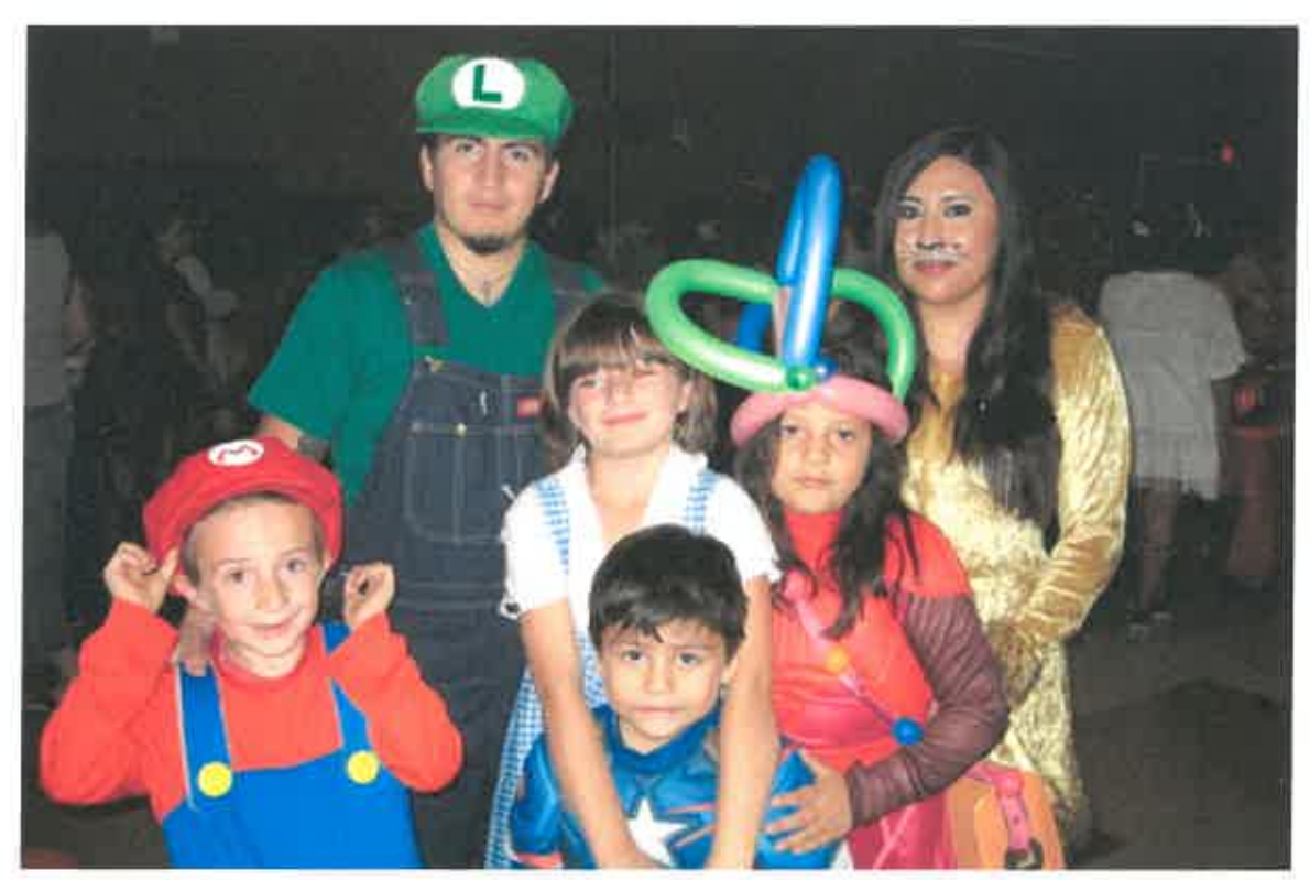
10.31.15 SAFE HALLOWEEN