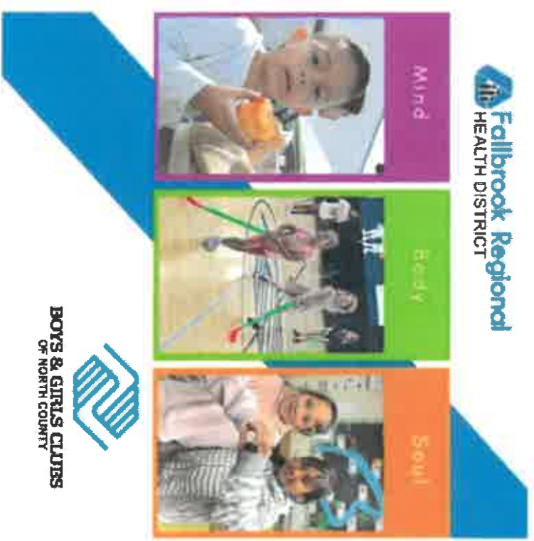
📷 Boost post

Thanks to our partners at Fallbrook Regional Health District , Boys & Girls Clubs of North County engages Club members in the Triple Play Program. Triple Play is a dyma... See more