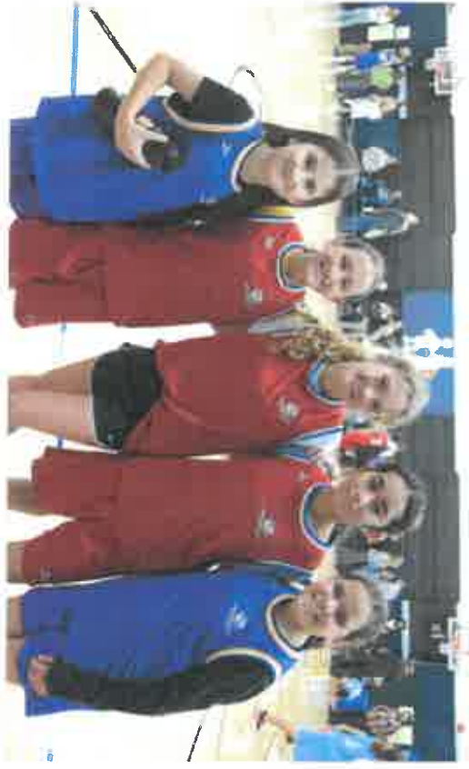
📌 post to get more reach for Boys & Girls Clubs of North County.

Great friends make for a Great game! #GreatFuturesStartHere Fallbrook Regional Health District