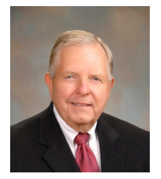
HOWARD SALMON CHAIR