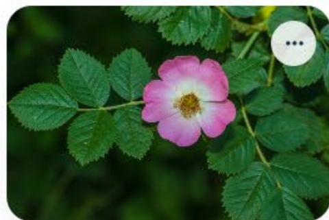
California Wildrose Rosa californica