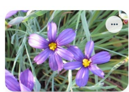
Blue-eyed Grass Sisyrinchium bellum