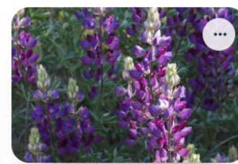
Silver Lupine Lupinus albifrons