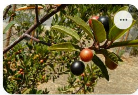
Coffeeberry Frangula californica