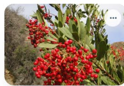
Toyon Heteromeles arbutifolia