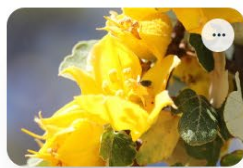
Flannel Bush Fremontodendron californicum