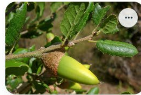
Coast Live Oak Quercus agrifolia