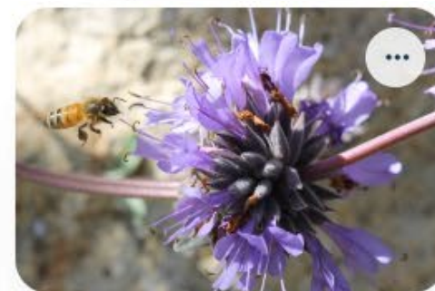
Cleveland Sage Salvia clevelandii