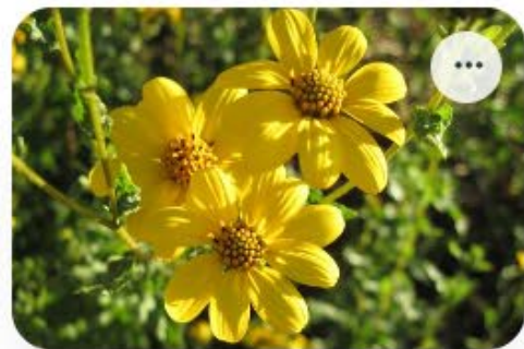
San Diego County Viguiera