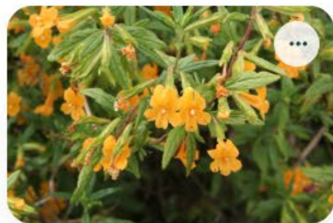
Bush Monkey Flower