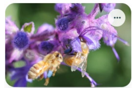
Woolly Bluecurls Trichostema lanatum