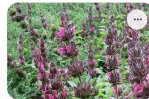
Hummingbird Sage Salvia spathacea