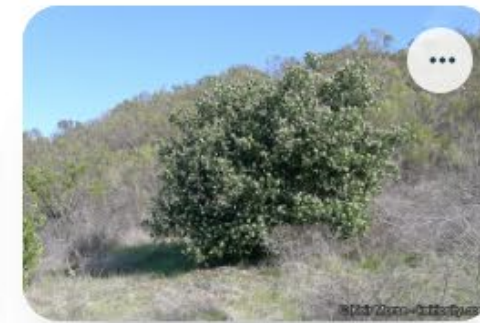
Lemonade Berry Rhus integrifolia