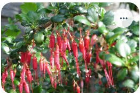
Fuchsiaflower Gooseberry Ribes speciosum