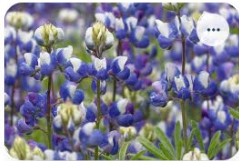
Miniature Lupine Lupinus bicolor