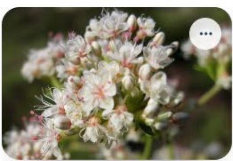
California Buckwheat Eriogonum fasciculatum