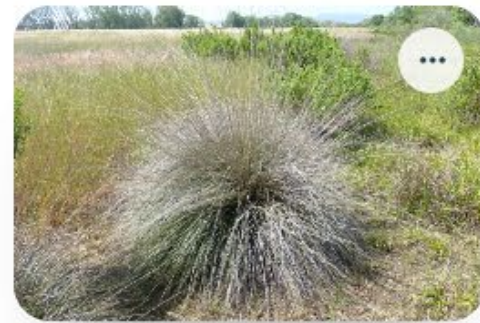
Deergrass Muhlenbergia rigens