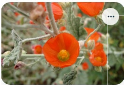
Desert Globemallow Sphaeralcea ambigua