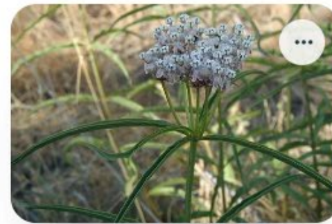
Narrow Leaf Milkweed