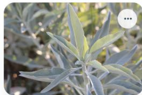
White Sage Salvia apiana