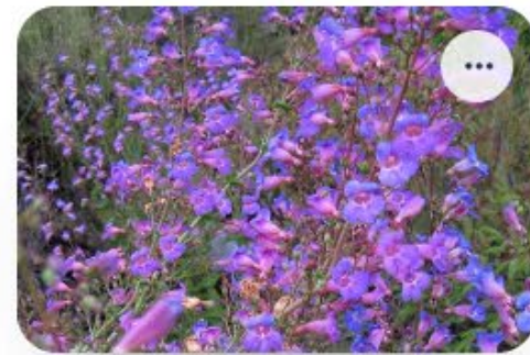
Showy Penstemon Penstemon spectabilis